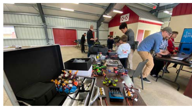
Drone Basics class

Music Theatre, STEAM, First Aid for Kids, Safe at Home, Jr. High Drawing, Cooking classes, Candle Creations, Adult CPR and First Aid, Rules of the Road for Seniors.