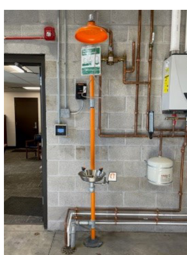
Emergency Shower and Eye Wash Station