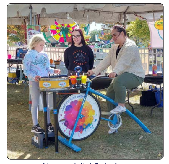
New activity! Spin Art

Adults and kids enjoyed the great music during the evening entertainment.