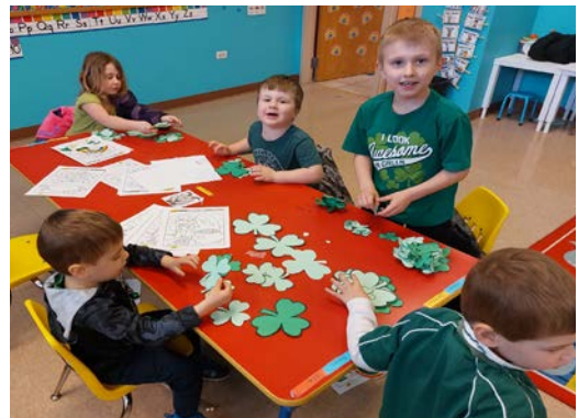
New! Shamrock Search Kids searched for hidden shamrocks around the program center.